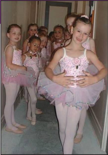
Children's Ballet students anticipate their turn onstage at the Mount Baker Theatre for the annual Spring Dance Recital.

event like this possible: "I feel so lucky to work productively with a group of people who work so earnestly and professionally."